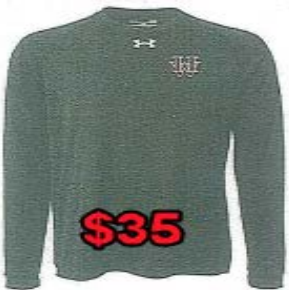
Men's Long sleeve